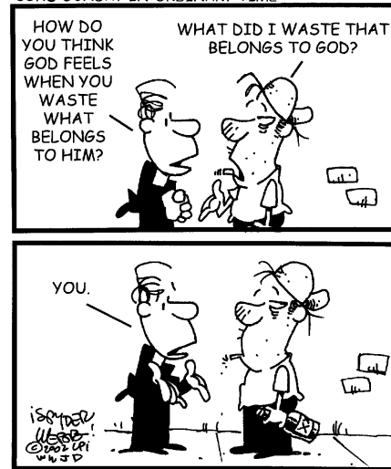
33RD SUNDAY IN ORDINARY TIME

The good news of today's Gospel is the extravagance of what is being given us. All we need do is be faithful in "small matters." The cost of fidelity has no comparison to the reward given.