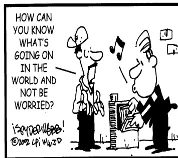
29TH SUNDAY IN ORDINARY TIME

Thank you so much for your dedication to the parish and your generosity, it works. And I promise to keep working to the best of my limited ability to justify your trust by stewarding your resources with transparency and efficiency. All for the greater glory of God!