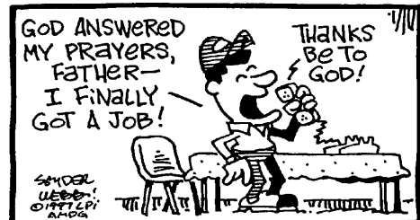
TRIUMPH OF THE CROSS

We ask you to call the rectory to add your names to the roster for the new positions, and we will contact you. Let's field the biggest and best liturgical team in the league.