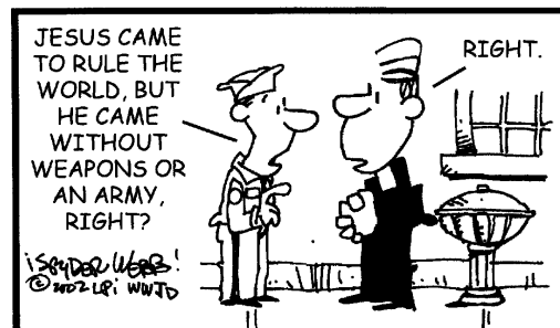
14TH SUNDAY IN ORDINARY TIME

On the other hand, maybe they were literally interpreting the words of St. Paul from the letter to the Galatians that 'it was for liberty that Christ freed us' and they wanted to witness to the separation of Church and State by their refusal. Then again, maybe not.