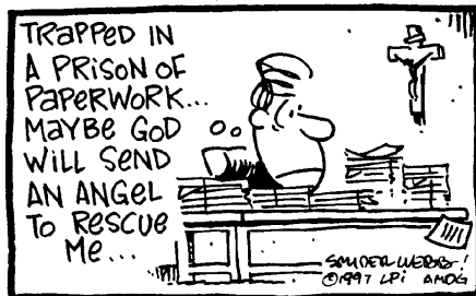
PETER AND PAUL, APOSTLES