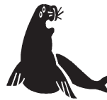
Meet Up! with Jesus