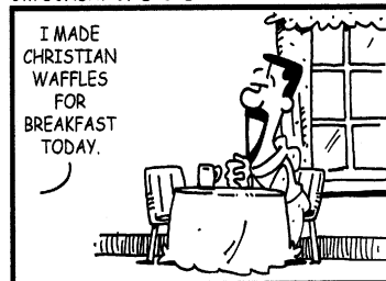
5th SUNDAY OF EASTER

In short, the type of chief whose desk is a clutter can be characterized as more independent, more adventurous, more generous, more forward looking, more likable and more effective than his counterpart whose desk is always in perfect array. That's not a bad set of adjectives for a priest who is forced to be a CEO, is it? Even if he can't find his notes to write his Pastor's Corner because of his messy desk.