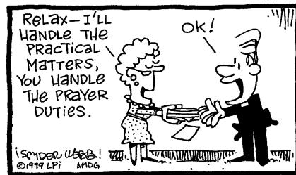
5 TH SUNDAY OF EASTER