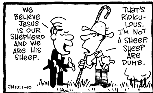
4 TH SUNDAY OF EASTER

So - "Let it rain, let it rain, let it rain."