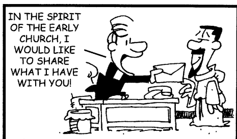
2ND SUNDAY OF EASTER

The Spring Craft Show sponsored by Holy Trinity School will be held from 10 AM to 3 PM on Saturday, April 12 in the Holy Trinity School cafeteria and Fr. Herrmann Hall. You will have over 100 tables to choose from in selecting the perfect gift or decoration for your home. Hot lunch and baked goods will be available. For further information, please call 412-264-0452.