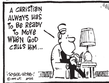
2 ND SUNDAY OF LENT

Actually, we do. It is called Lent. Wake up!