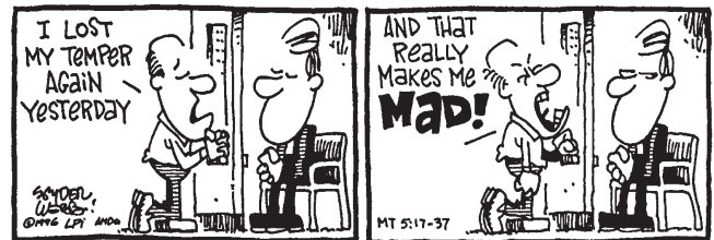
6th SUNDAY IN ORDINARY TIME

All year-end contribution statements have been mailed to parishioners. If you do not receive envelopes, you will not receive a report. If you receive envelopes, but didn't use them, you will receive a report marked $0.00 contributions, and the computer may deactivate you. You may be removed from the envelope list. And your status is reduced to inactive parishioner, which means that you will not qualify for things like sponsorship certificates and a number of other things. Of course, you always have the right to come to Church, receive the sacraments if you are spiritually disposed and call upon the clergy for pastoral service. But you will lose some of the privileges of active participation.