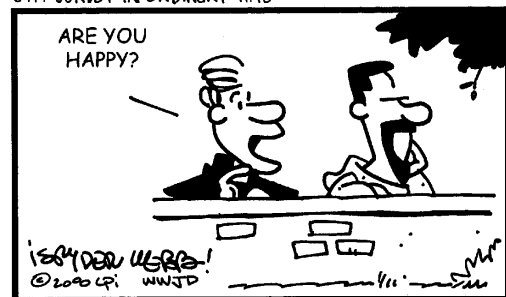
6TH SUNDAY IN ORDINARY TIME

(However, we would be most appreciative if sooner or later the offering envelopes that didn't make it to Mass last week would eventually find their way to us. We have a lot of snow removal and utility bills to make up for. Bless you.)