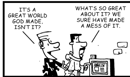
3RD SUNDAY OF ADVENT

We are into the Advent Season. It is the perfect time to work on becoming professional Christians in the finest sense. And remember: it ain't Christmas until it's Christmas!