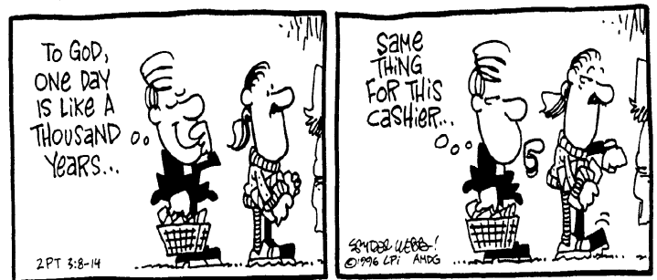
2 ND SUNDAY OF ADVENT