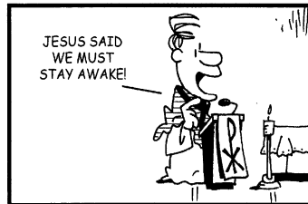
1ST SUNDAY OF ADVENT

I am certain the Lord will be with you through this time of adjustment. And with your spirit!